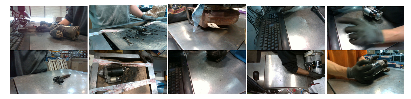
Figure 1: Sample industrial images taken in by operators at the EIBA project location depicting miscellaneous issues such as clutter, dirt, cropping, occlusion, and blur. Our dataset and the visual contexts address such issues with industrial data collection.

simulate the different visual contexts in which industrial objects are generally digitised during inference time. The context of the images changes, but the underlying features of the target object remain constant, making it ideal for our investigation. Datasets such as NICO [4] and NICO++ [8] also present object classes in different visual contexts. However, the industrial objects in our dataset are unlikely to be present in general large pretraining datasets such as ImageNet [3]. The dataset can, thus, serve as a useful downstream dataset for research investigations. Figure 2 shows sample images for the four subcategories.