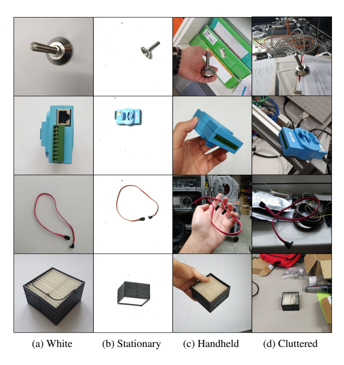
Figure 2: Example of images from the InVar-100 dataset with the subcategories. Taken from [2].